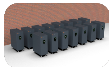
Support 15 Pcs in Parallel

Guangzhou Felicity Solar Technology Co.,Ltd.