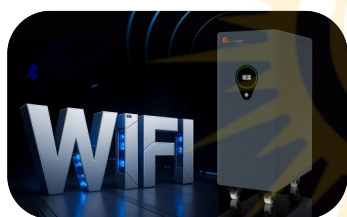
Built-in WiFi / Bluetooth for Remote Monitoring