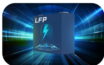
Longer Lasting LiFePO4 Battery