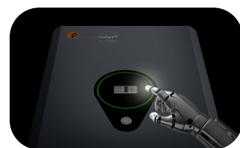
Real-time Status via LCD Display