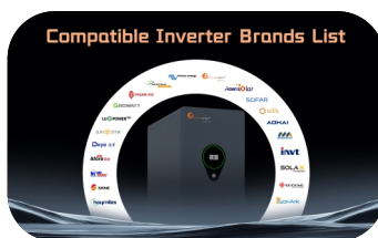
Wide Inverter Compatibility